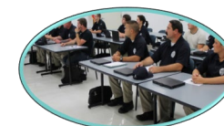
Engagement & Training Concepts for Law Enforcement